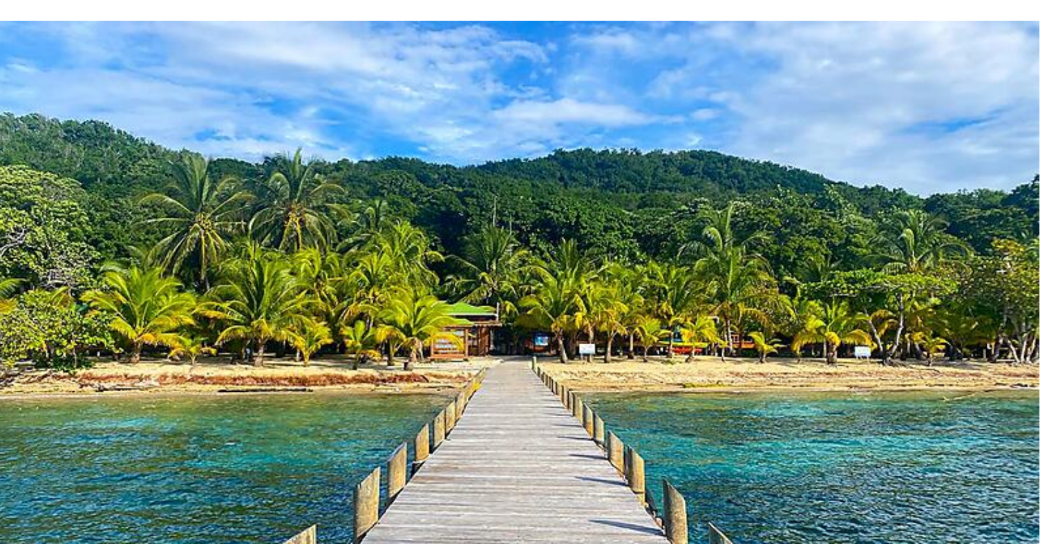
The information in this document is valid as of 20/4/2024

Half Moon Caye, the picture postcard view of Belize, is also on the programme of this cruise; in this enchanting place, you will be able to see nesting frigatebirds and red-footed boobies close up. The Great Blue Hole cenote, a UNESCO World Heritage Site, is one of the world's most stunning diving sites. On Water Caye , the Mesoamerican Barrier Reef System is also teeming with many treasures for those who venture into its waters.